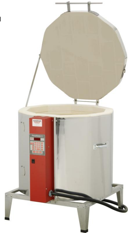
Kiln properly placed on Evenheat supplied stand.